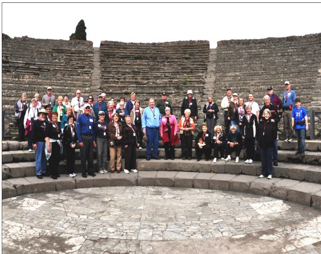
At the ancient Pompeii amphitheater