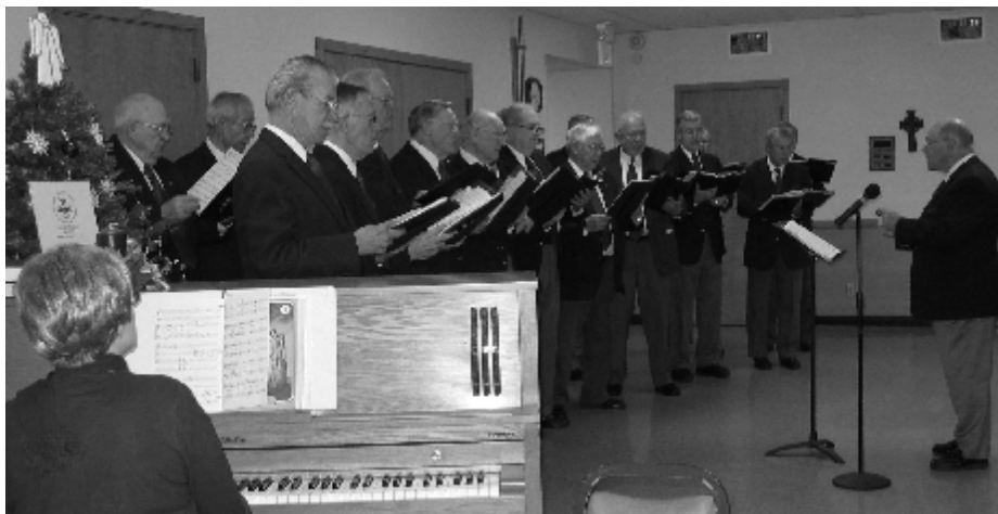
The Village Men's Chorus presented a musical program at the Men's Association breakfast on December 15. The Kirk men meet the third Friday of every month for coffee, doughnuts and to hear an interesting speaker. This month's meeting is on January 19. Come join the fun.