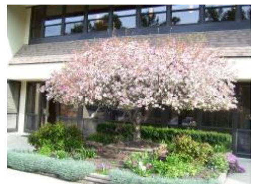
Easter Sunday, March 23rd God dressed our tree in a beautiful new gown of blossoms.