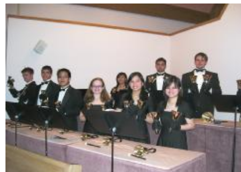
Following intermission, University Ringers prepare to begin the second half of the program.